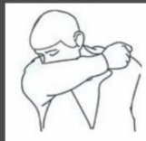
or your sleeve