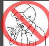
NOT your hand

Nan texu ma nan tirigiso katta an segeñantonbe